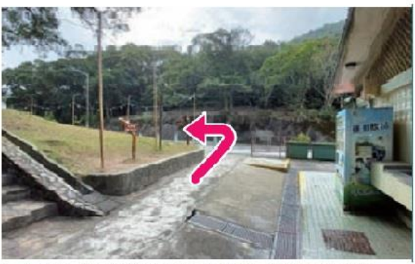
1. Leave Chek Keng then turn left along the road, don't go upstair