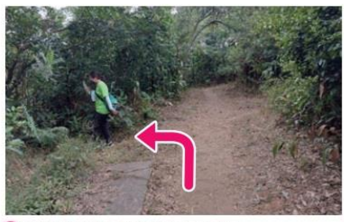
2 turn left at the junction to leave the MacLehose Trail