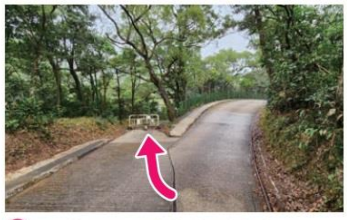
you will see a campsite then turn left when you see the road. Go into the gate to enter